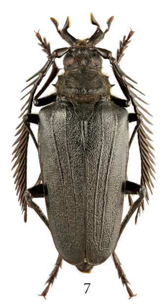
Figs 7-8. Monocladum iranicum Villiers, 1961, habitus, dorsal view. Fig. 7. Male (36 mm). Fig. 8. Female (40 mm).

Distribution. – Southeastern part of Iran.