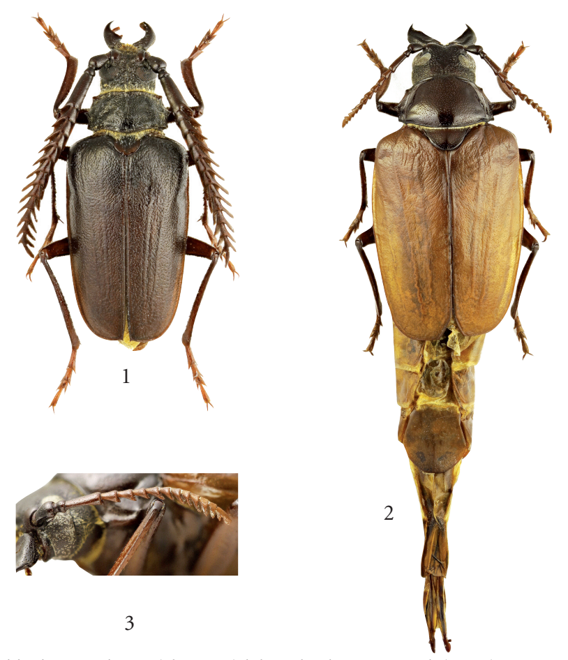
Figs 1-2. Polylobarthron margelanicum (Théry, 1896), habitus, dorsal view. Fig. 1. Male (34 mm). Fig. 2. Female (28 mm). Fig. 3. P. margelanicum . Female, left antenna, lateral view.