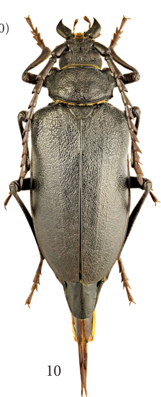
Figs 9-10. Mesoprionus petrovitzi (Holzschuh, 1981), habitus, dorsal view. Fig. 9. Male, (45 mm). Fig. 10. Female (49 mm) (all specimens illustrated in Jiri Lorenc coll.).

Material studied. – 1 female, Sarbezhan vill., about 2810 m in alt., 10 km NW Dalfard, 75 km NW Jiroft, Kerman district, SE Iran, 10-VII-2008, J. Dalihod leg. , in JLC.